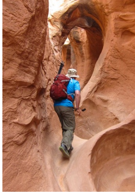
Slot Canyon Scrambling

Slot Canyon: 1-2 hrs, ca. 1 mi / 2 km, elevation difference: +/-100 m