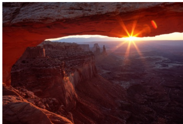
Mesa Arch, Canyonlands NP