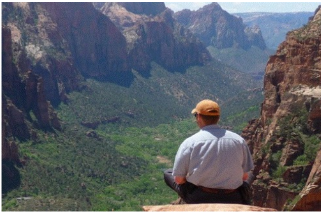
Angel's Landing - Zion National Park