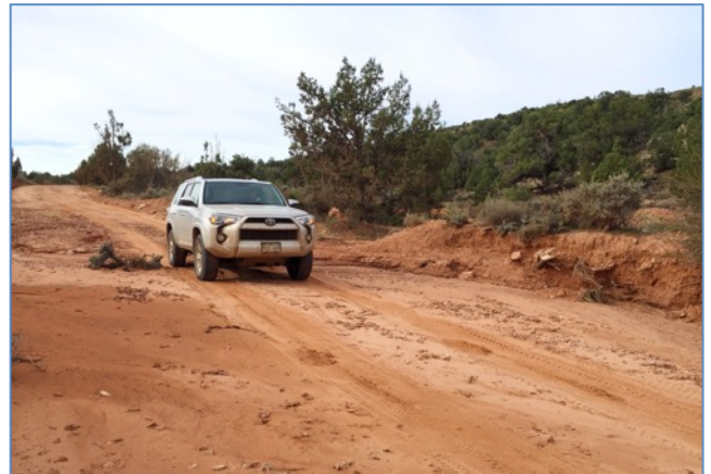
Grand Staircase-Escalante National Monument