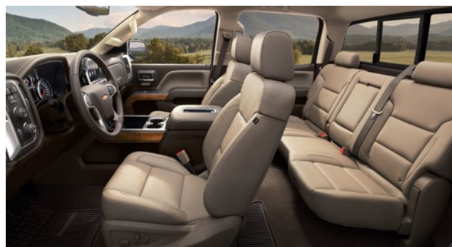
Chevy 2500 Interior