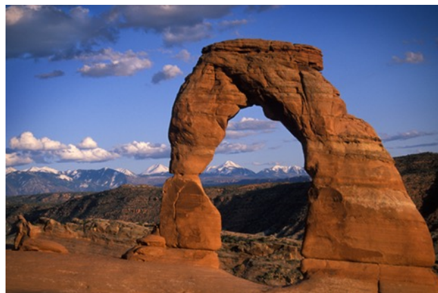
Delicate Arch, Arches National Park

Mesa Arch: 30 minutes, ca. 1 mi / 1.5 km, elevation difference: +/-30 m