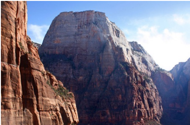
Zion National Park