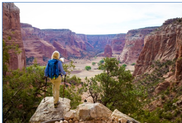
Canyon de Chelly trek

Twin Trail to Bare Trail: 5-6 hrs, ca. 6-7 mi, 12 km, elevation difference: -300m