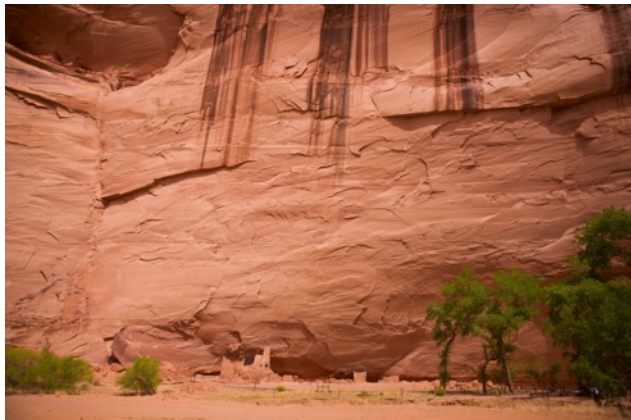
Anasazi Ruins in Canyon de Chelly

Bare Trail to White House: 3-4 hrs, ca. 4-5 mi, 8 km, elevation difference: +200m