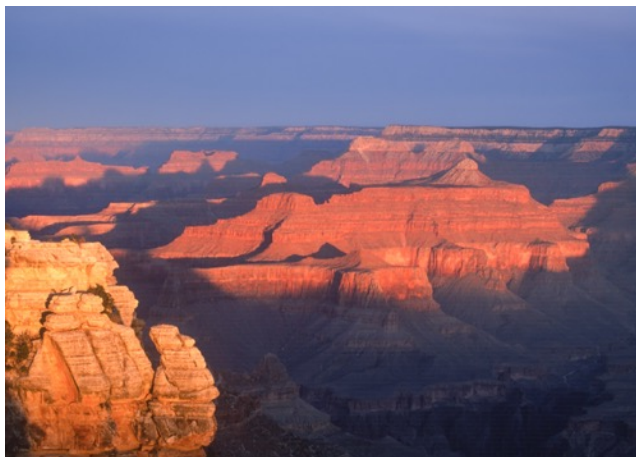
Grand Canyon National Park

Hike along the rim: up to 4 hrs, up to 8 mi / 13 km, elevation difference: +/-50 m