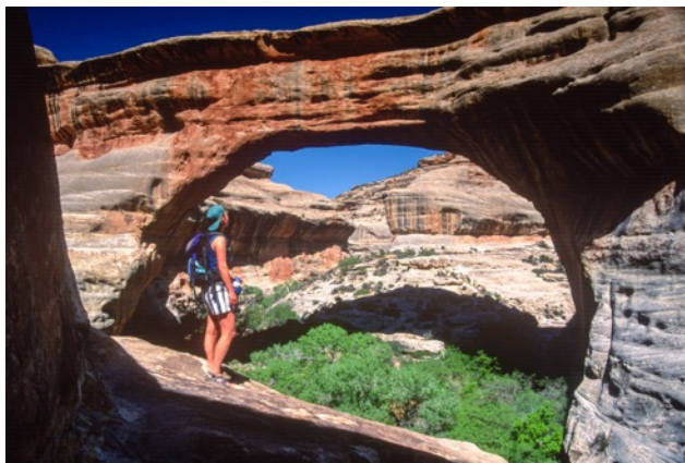
Natural Bridges NM

We head south towards our next destination: Natural Bridges National Monument. This canyon is home to 3 massive stone bridges. First, we will follow a steep slick rock trail descending to Sipapu Bridge. Walking in the canyon we soon reach massive Kachina Bridge covered in rock art. A dirt track leads down the Moqui Dugway to Monument Valley. You have a chance to take a jeep tour (optional, starting at $75 pp) or drive the scenic road yourself. Tonight we stay in the historic Thunderbird Lodge at Chinle, an old trading post built in 1896. Thunderbird Lodge (3-star) or similar, 1 night.