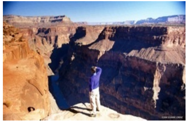
Grand Canyon National Park