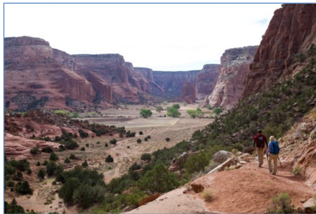
Canyon de Chelly trek