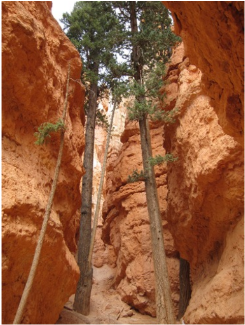
Bryce Canyon National Park