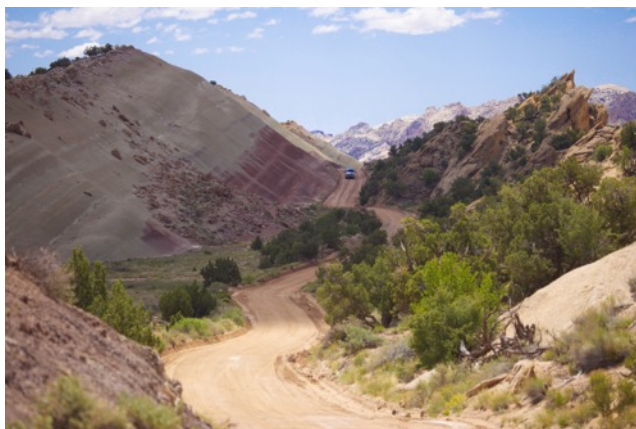
Burr Trail & Notom Bottom Road

San Rafael Reef Slot Canyons Loop: 4-5 hrs, 7 mi / 11 km, elevation difference: +/-300 m