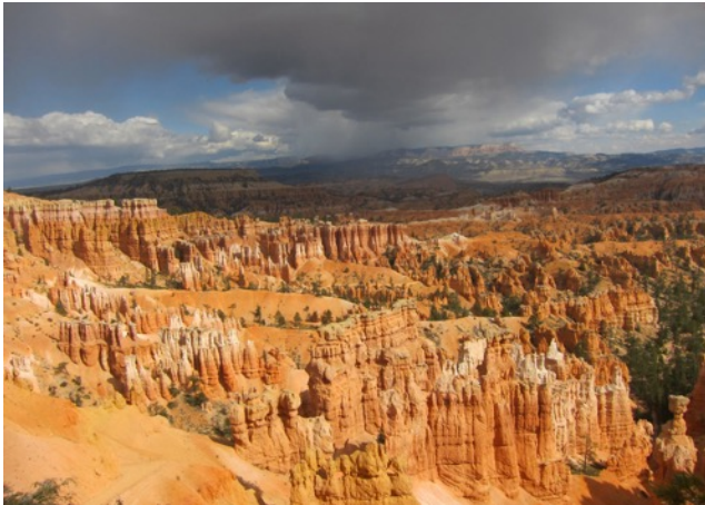
Bryce Canyon National Park