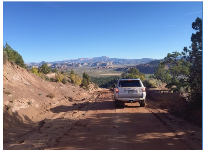
Desert Tracks to Bryce

Queens Garden & Peekaboo Loop: 5 hrs, ca. 8 mi / 12 km, elevation difference: +/-300 m