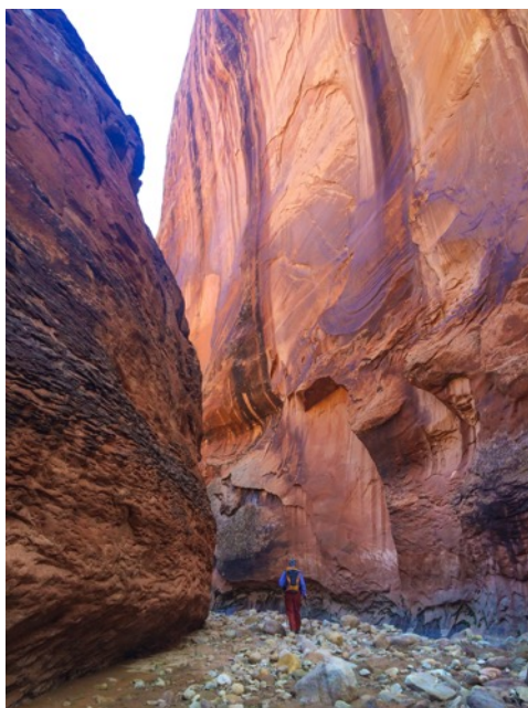
Slot Canyon scrambles